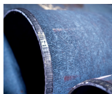
8. Beveled Spigot