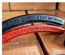
6. TR Flex® Locking Segments