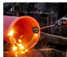
9. Cleaning the Pipe Bell