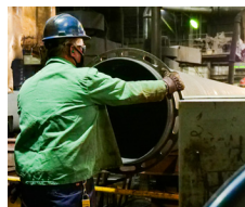
3. Gauging the Spigot