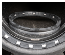
2. Sure Stop Gaskets