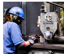
4. Machining a Sample