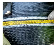
7. Outside Diameter Tape Measurer