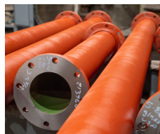
1. Glass-Lined DI Pipe