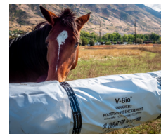
5. V-Bio® Polyethylene Encasement